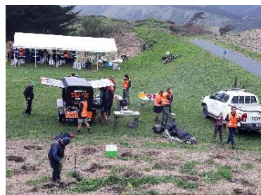
Planting HQ and free sausage sizzle.