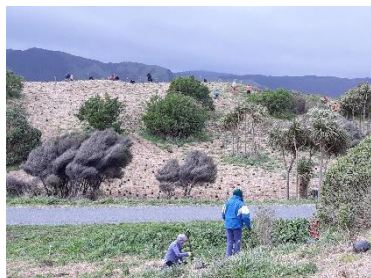
Planting on the hill behind the club house