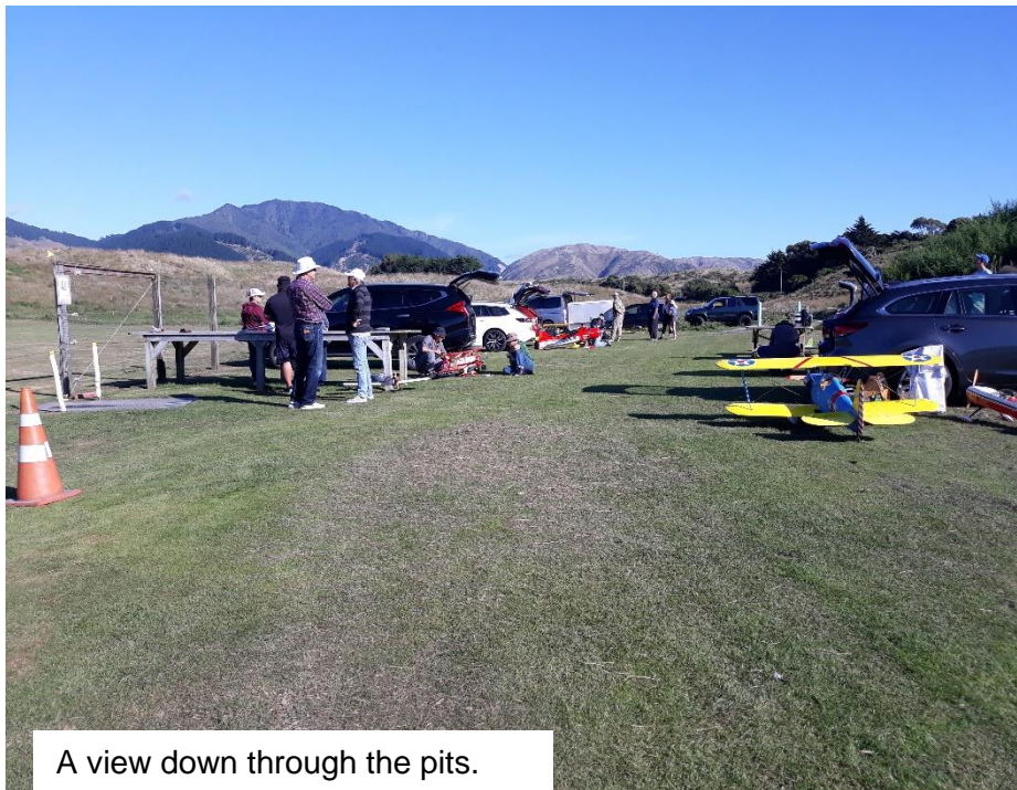
A view down through the pits.