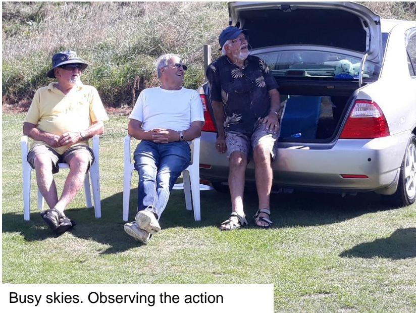
Busy skies. Observing the action