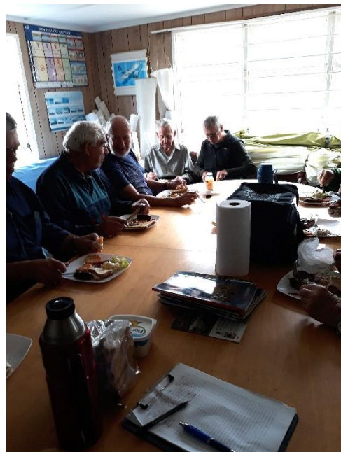
It's great to be back