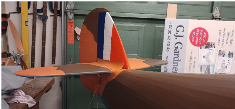
Don making great progress on the Hurricane. Looks a different beast with some paint on.